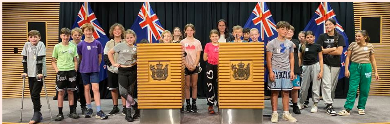
Koputaroa School students in the Beehive Theatre

A full list of those schools receiving grants from the Trust are listed at Appendix 6.