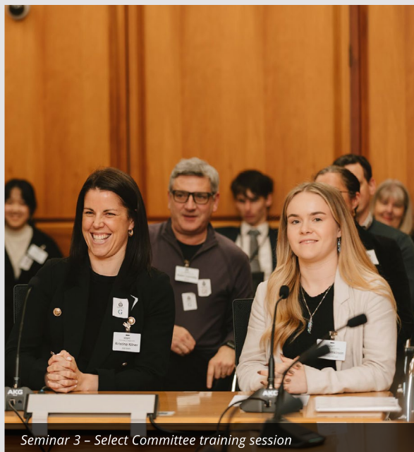
Seminar 3 – Select Committee training session