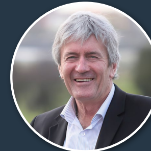
THE HON DAMIEN O'CONNOR MP List MP, Labour Party Representative