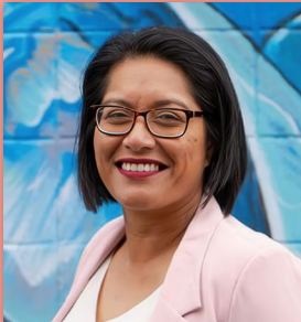
Hon Barbara Edmonds MP Labour Party

Two Members of Parliament became Associate Members following the successful completion of Business Attachment programmes.