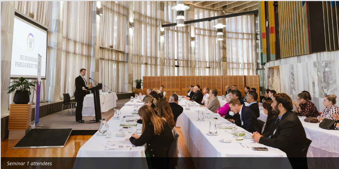
Seminar 1 attendees