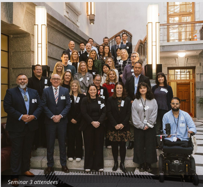
Seminar 3 attendees