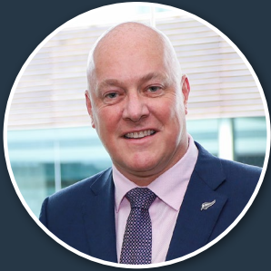
RT HON CHRISTOPHER LUXON

Prime Minister, Leader of the National Party