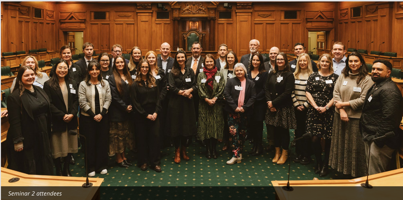
Seminar 2 attendees

At the end of the day, they were joined by Wellington based corporate members of the Trust at the Wellington network event.