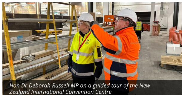
Hon Dr Deborah Russell MP on a guided tour of the New Zealand International Convention Centre