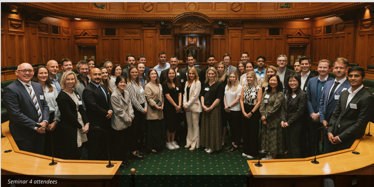
Seminar 4 attendees

Attendees from 22 of our corporate members attended an extended sitting of the House in the morning and observed the passage of a Bill, participated in a mock select committee, gained insights into policy making, executive branch of Government, legislation, and the financial cycle, and enjoyed lunch in the historic Legislative Council Chamber with Members of Parliament.