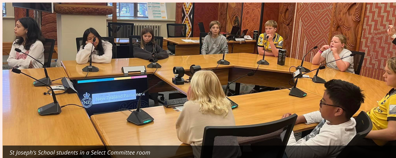
St Joseph's School students in a Select Committee room