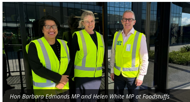
Hon Barbara Edmonds MP and Helen White MP at Foodstuffs