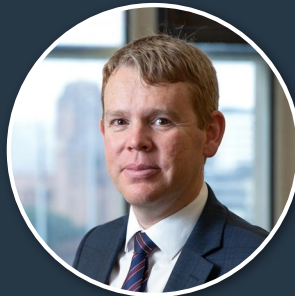
RT HON CHRIS HIPKINS

Prime Minister, Leader of the National Party