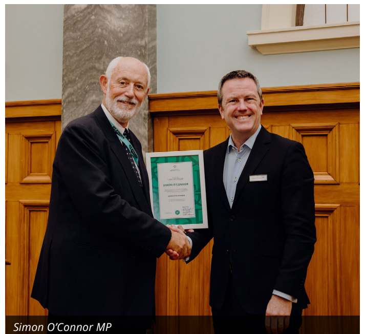
Simon O'Connor MP