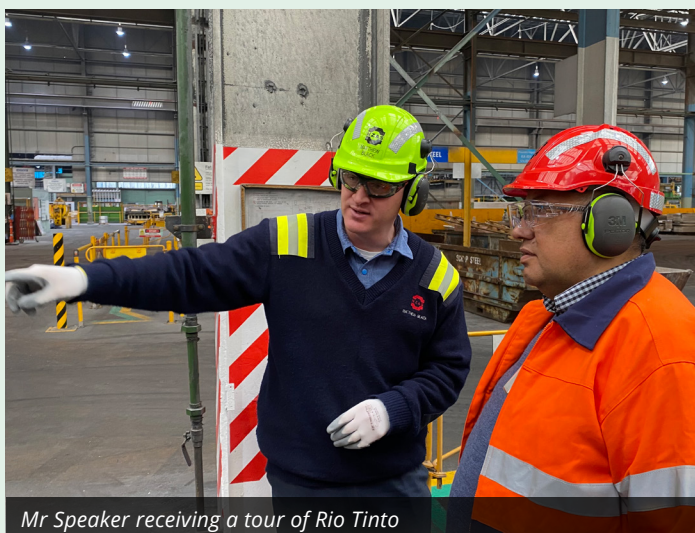
Mr Speaker receiving a tour of Rio Tinto

We warmly thank the Speaker for undertaking these visits.