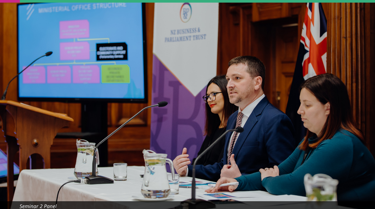
Seminar 2 Panel

TO ADVANCE AND ENCOURAGE BUSINESS UNDERSTANDING OF PARLIAMENT AND PARLIAMENTARIANS UNDERSTANDING OF THE BUSINESS COMMUNITY OF AOTEAROA NEW ZEALAND