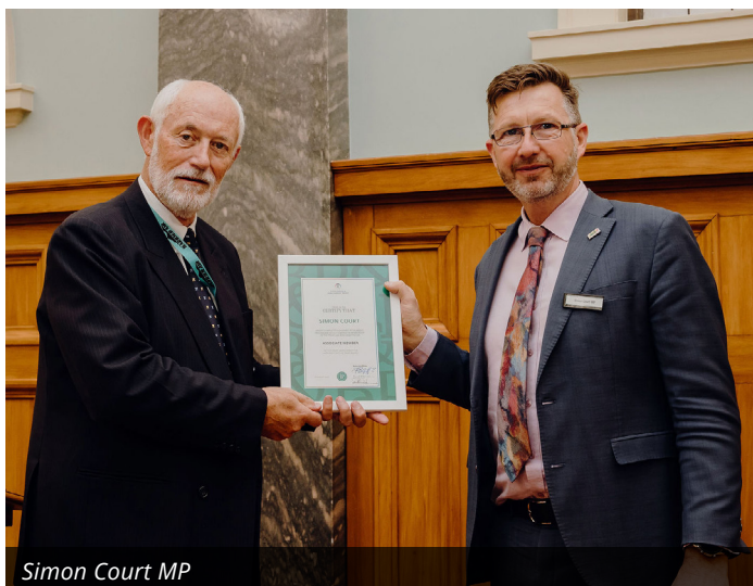
Simon Court MP