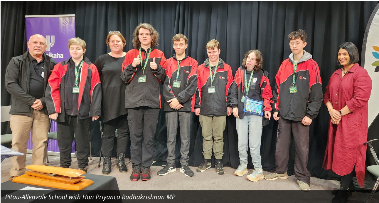
Pītau-Allenvale School with Hon Priyanca Radhakrishnan MP

and programmes encompassing a range of civic visits and fun activities that the Capital has to offer. School visits have been steadily returning to pre pandemic levels and to date have supported 45 schools this year.