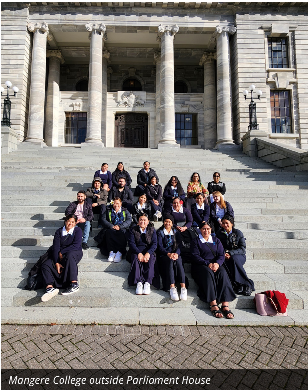
Mangere College outside Parliament House