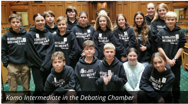
Kamo Intermediate in the Debating Chamber