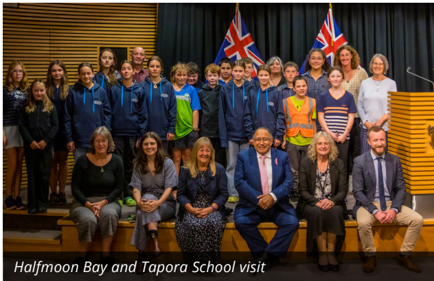
Halfmoon Bay and Tapora School visit