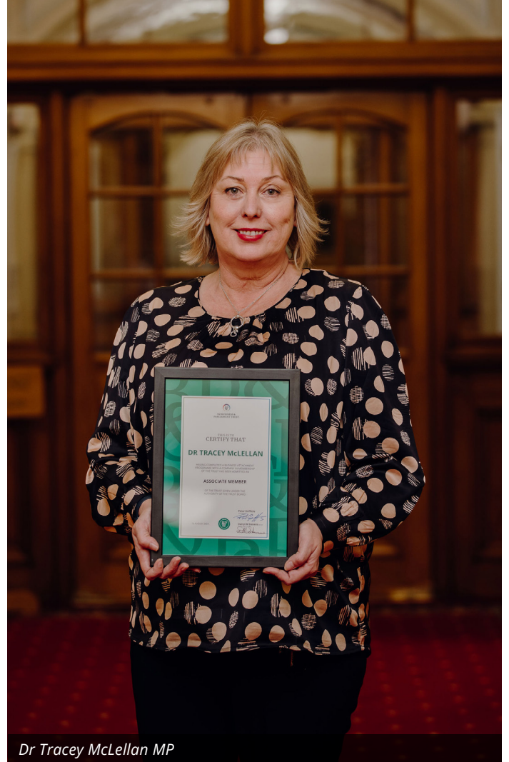
Dr Tracey McLellan MP

We thank our corporate members for arranging programmes and hosting the Members of Parliament.