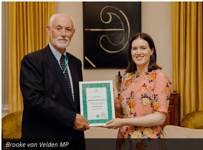
Brooke van Velden MP